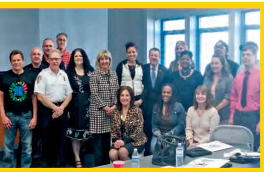
▲ Senator Brewster attends New Kensington-Arnold Youth Commission training session.