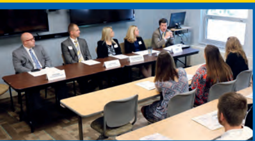
▲ High school students from throughout the district attended Senator Brewster's Annual Student Government Day at Penn State Greater Allegheny.