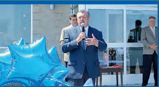
▲ Senator Brewster speaks at the ribbon cutting of the Voyager facility at the Allegheny County Airport in West Mifflin.