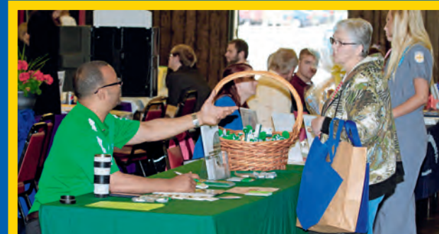
▲ Seniors take advantage of the wide variety of information and screenings at Senator Brewster's Spring Senior Expo in West Leechburg.